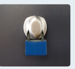
Padlock Receptor Padlock not included (supplied by others)